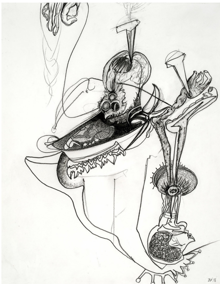
Cathedral , 2018, graphite on paper, 14 x 11 in.

Opening Reception: Saturday, July 13, 7-9:30pm