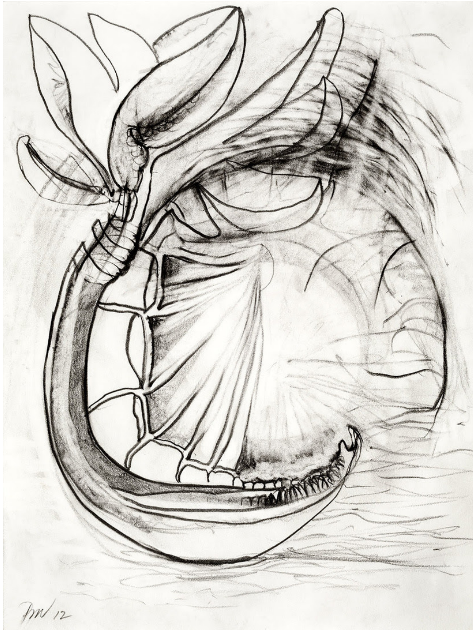
Passage, 2012, graphite on paper, 12 x 9 in.

The artist hones in on the allusive potential of floral images, examining aspects of their existence as organisms both beautiful and tragically fragile, as well as their predatory and carnivorous habits, as in Venus fly-traps and other tropical plants. These forms take on a threatening nature in Quicken , Plank , and Passage , wherein the bulbs of the plant take on menacing, jaw-like traits and sharply conflict with our presumed understanding of them as harmless and non-sentient.