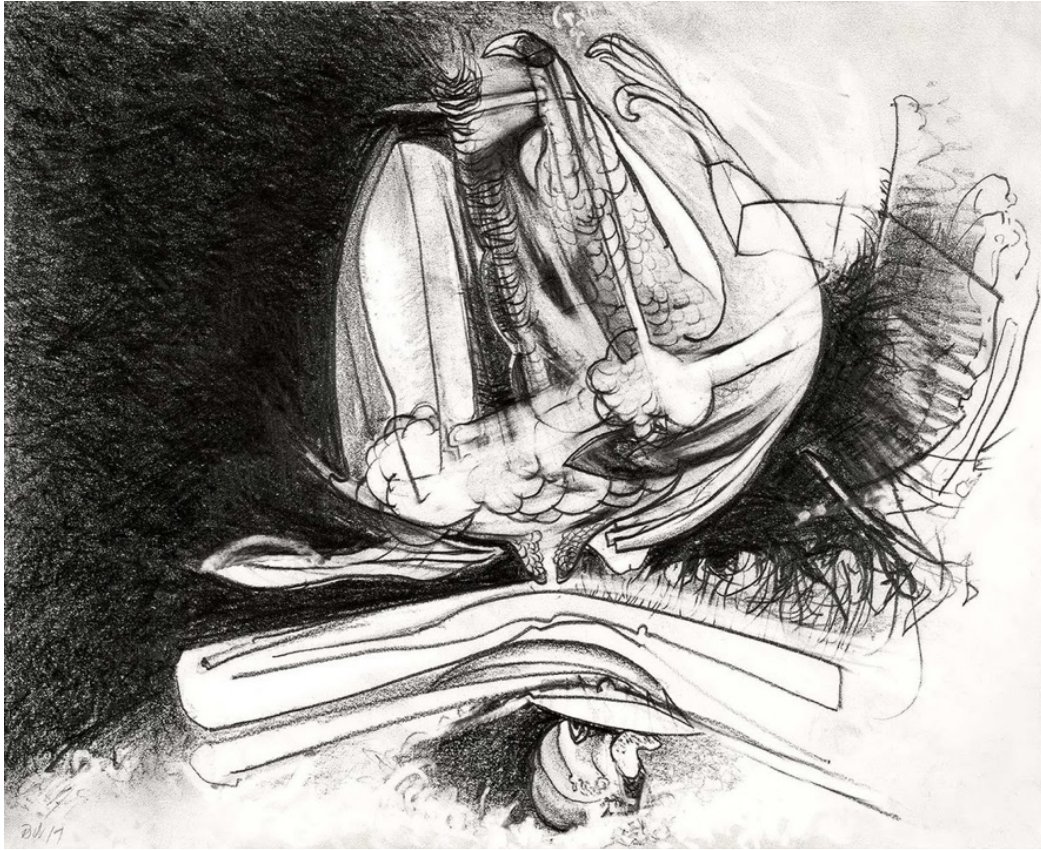
Plank , 2017, graphite on paper, 11 x 14 in.

Brian Wood is a painter working with multiple media in New York City and East Chatham, NY. His paintings, drawings, photographs, prints, films, and books are exhibited internationally and are held in many private and public collections. Wood is in the permanent collections of the Museum of Modern Art in New York, the Brooklyn Museum, and the Metropolitan Museum of Art; the National Gallery of Art in Washington, DC; the Ludwig Museum in Cologne; the Los Angeles County Museum of Art; the Houston Museum of Fine Arts; the Blanton Museum of Art in Austin, TX; the New York Public Library: the National Gallery of Canada, Ottawa; the Art Gallery of Hamilton, Ontario; the Davis Museum, Wellesley; the Tampa Museum of Art; Asheville Art Museum, NC; the Montreal Museum of Fine Art; the Museum of Contemporary Art in Montreal; The Canada Council Art Bank; Concordia Art Gallery, Montreal; the Museum of Modern Art in Prague; and many others.