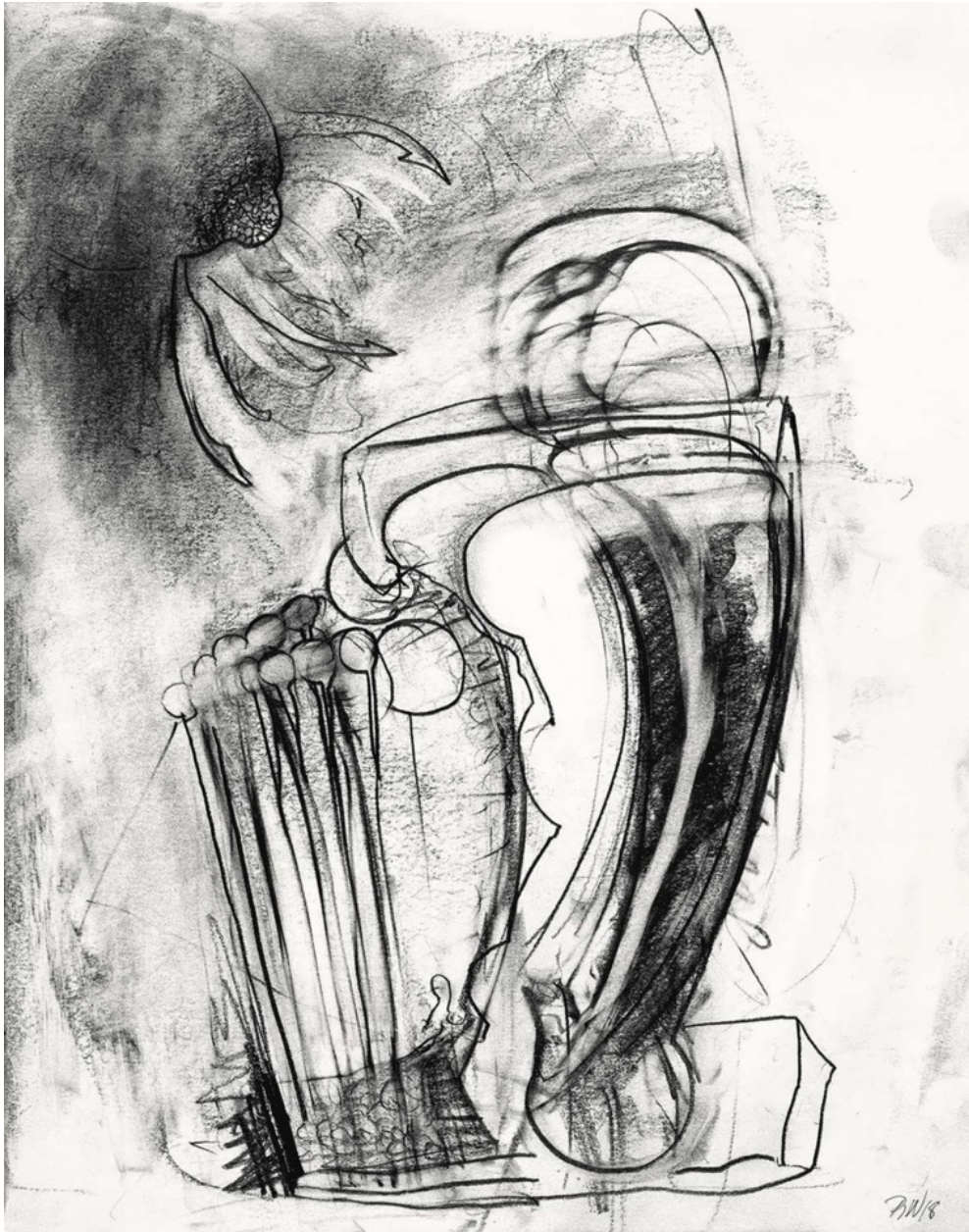
Chora , 2018, graphite on paper, 14 x 11 in.